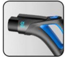
Other charging equipment